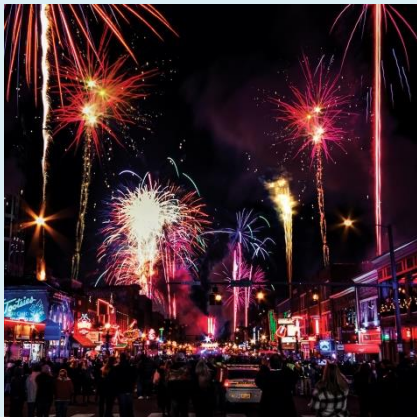
Nashville NYE shot with Cobra Firing System

While we do our best to ensure all shows are pulled and packaged with ALL required shells and e-matches, occasionally there may be a variation in packing. NOT all like shells are always packed in the same box. E-matches may also be in a separate box than their intended shells. Should you find yourself missing shells or e-matches, please check ALL boxes. After checking all boxes and something is still missing, please contact Chad or Steve to discuss the best solution for proceeding with the show.