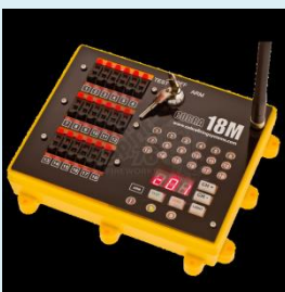
Cobra Firing System

Both firing systems enable Pyro Shows to precisely execute the perfect display, otherwise impossible without a digital firing system.